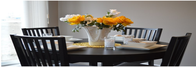
Table Talk: JOY

Joy is a great feeling of pleasure and happiness. No matter what the days bring us, take a moment and focus on the things that bring you joy this season and talk about it as a family.